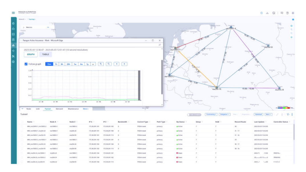
Figure 3: An example of routing based on correlated end-to-end latency and streaming telemetry.

Active assurance for data-plane testing and monitoring: Provides active data-plane KPI monitoring and on-demand measurements, by deploying software-based test agents across routers in your network, as well as in third-party domains, such as cloud service providers. Alongside streaming telemetry, it provides enhanced, real-time network observability and forms the basis for remediation based on perceived customer experience. It complements telemetry data by providing visibility of customer-impacting issues where telemetry data alone may not. It also enables proactive monitoring: measuring performance using synthetic traffic, to simulate network usage even if there is no live traffic.