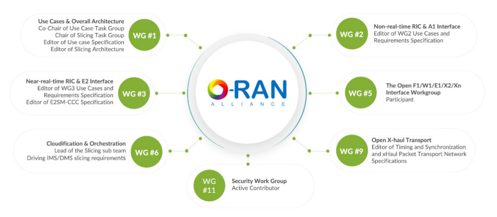
Figure 3: Juniper is championing Open RAN by working closely with ecosystem partners in the industry. Juniper contributes to seven working groups in the O-RAN Alliance and serve as the chair and co-chair of the slicing and use-case task groups

Juniper is an active proponent of Open RAN in several industry and standards organizations. Juniper contributes to 7 of the 11 working groups in the O-RAN Alliance. Juniper chairs the Network Slicing Task Group, co-chairs the Use Case Task Group, and serves as editor and contributor to several specification documents.