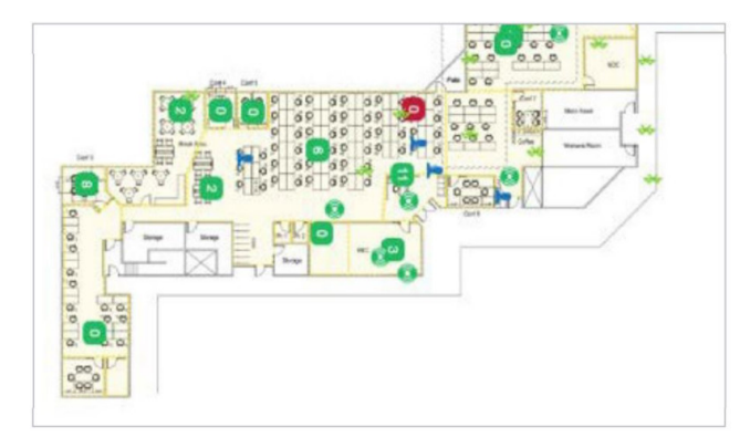
The AP21 works with the Juniper Mist cloud to provide high-accuracy, enterprise-grade Bluetooth LE location services using virtual beacons

The AP21 has a 16-element Virtual Bluetooth LE (vBLE) antenna array controlled from the Juniper Mist cloud. Passive antennas enhance the power of a single transmitter and produce directional beams to accurately detect distance and location with 1 to 3 meter accuracy. With Juniper's patented vBLE technology, you can deploy an unlimited number of virtual beacons in your physical environment without requiring battery-powered BLE beacons.